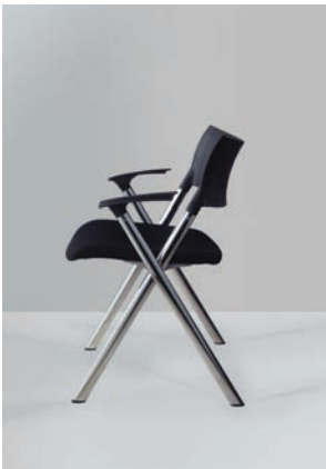
Martin training chair MT 1000