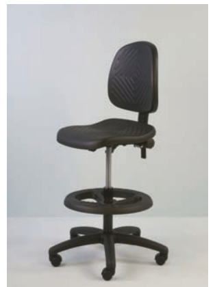
Industrial draughtsman IN 5130D