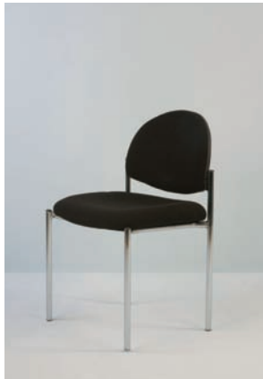
Generic visitor side chair AL 719