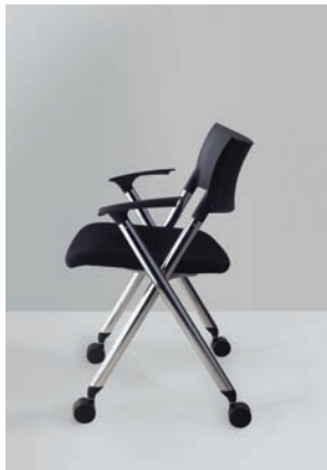
Martin training chair with castors MT 1001