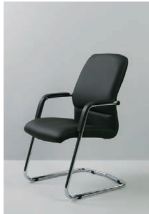
Lion visitor LN 5180