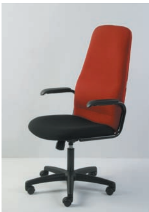
Comet high-back CM 5190