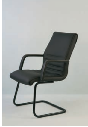
Paq visitor PQ 5180