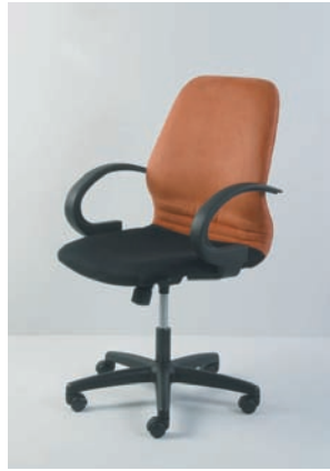
Jaguar medium-back JG 5150