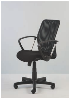
Air operator AR 5150