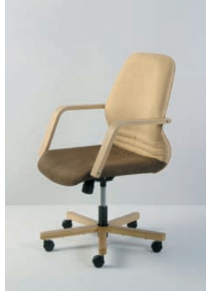
Jaguar laminate medium-back JW 5150