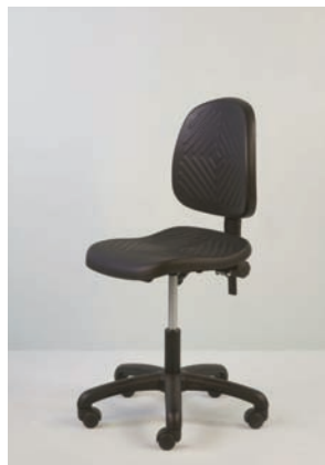
Industrial typist IN 5130