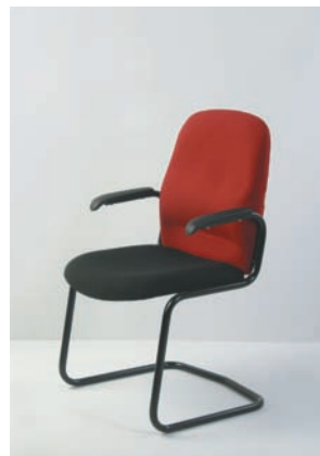
Comet visitor armchair CM 5180