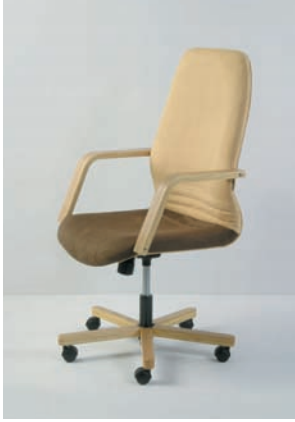
Jaguar laminate high-back JW 5190