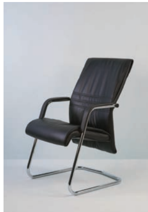
Wing visitor WG 5180