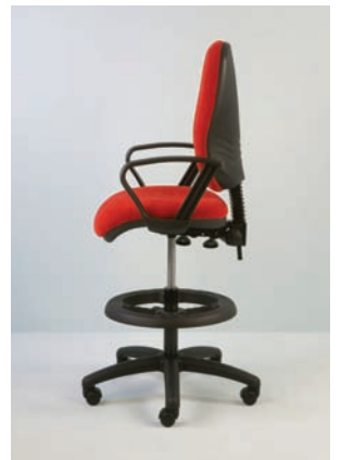
Task draughtsman OC 5130D