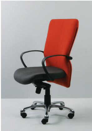
Attribute high-back AT 5190