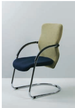
Icon visitor IC 5180