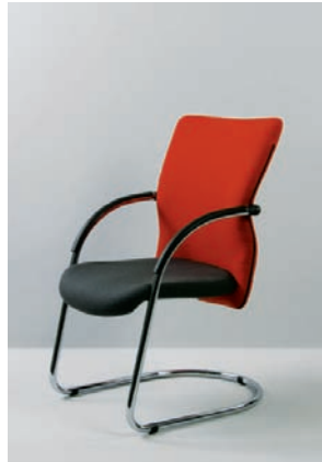
Attribute visitor AT 5180