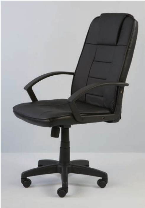
Flash managerial high-back AL 123