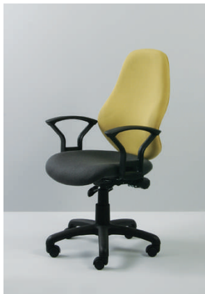
Task medium-back OC 5150