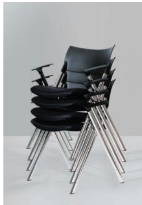
Martin training chair stacked MT 1000