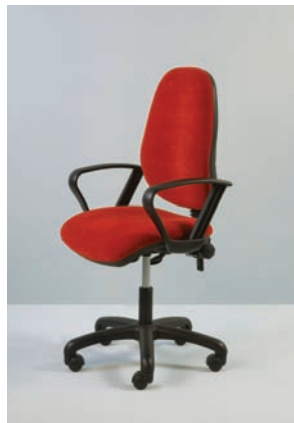
Task typist OC 5130