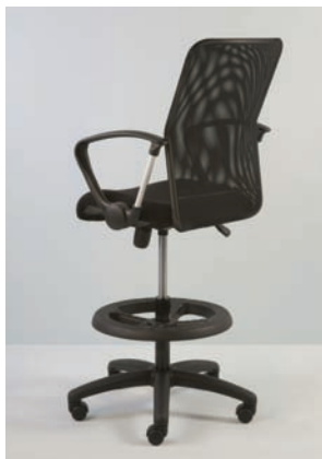
Air draughtsman AR 5150D