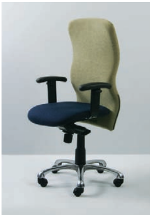
Icon high-back IC 5190