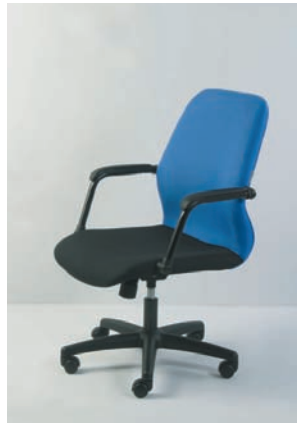
Leopard medium-back LP 5150