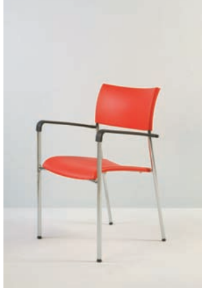
Tosca nylon chair with arms NC 1781 (without arms NC 1780 )