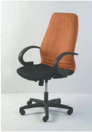
Jaguar high-back JG 5190