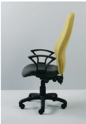
Task high-back OC 5190