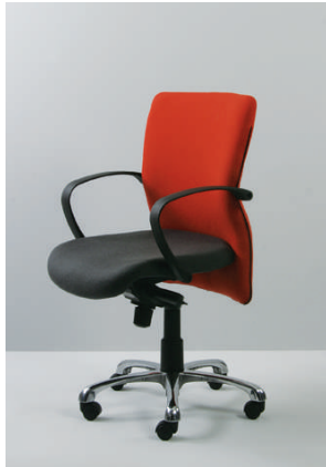
Attribute medium-back AT 5150