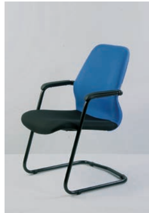
Leopard visitor LP 5180