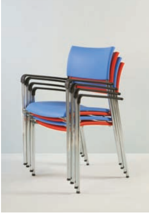
Tosca nylon chair with arms stacked NC 1781