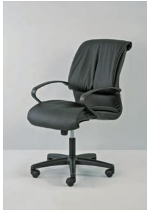
Puma medium-back PR 5150