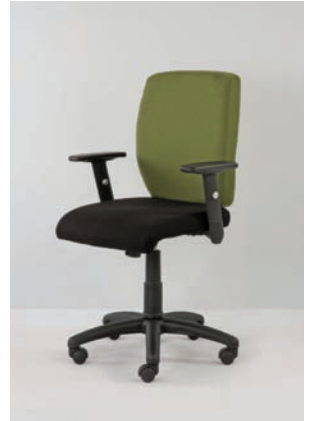
Quadra operator QD 5150