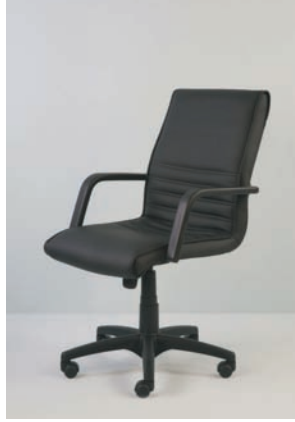
Paq medium-back PQ 5150