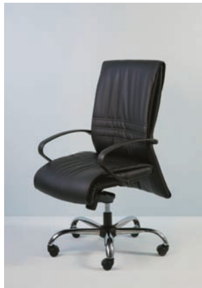
Wing medium-back WG 5150