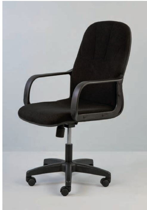
Flash office medium-back AL 214F