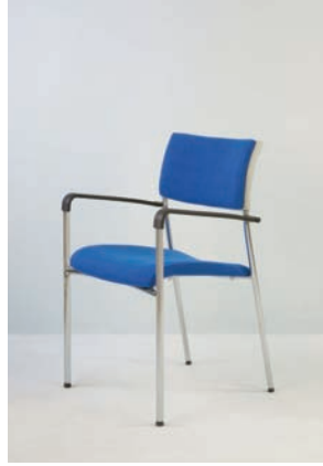
Tosca upholstered chair with arms NC 1783 (without arms NC 1782 )