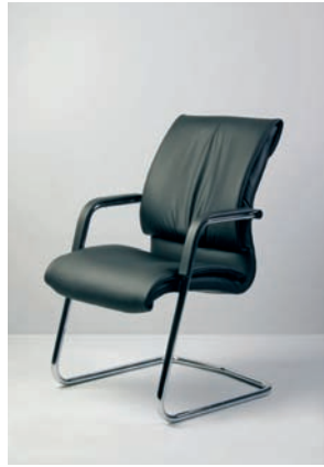
Puma visitor PR 5180