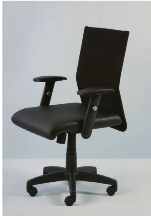
Flash slimline medium-back AL 512