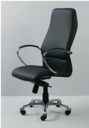
Lion high-back LN 5190