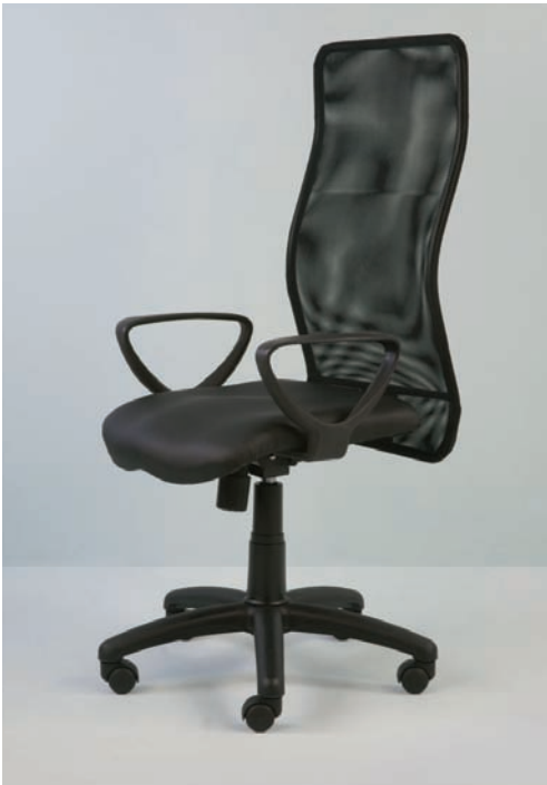
Flash mesh high-back AL T10