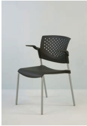
Butterfly chair with arms and nylon seat BF 2125