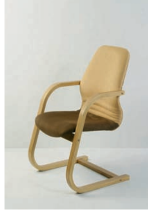
Jaguar laminate visitor sleigh JW 5170