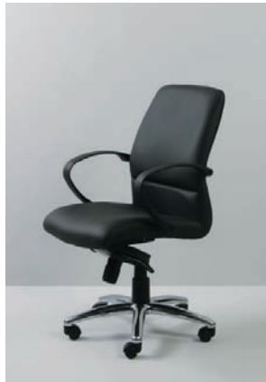
Lion medium-back LN 5150