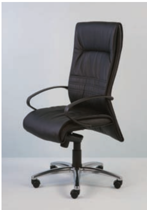
Wing high-back WG 5190