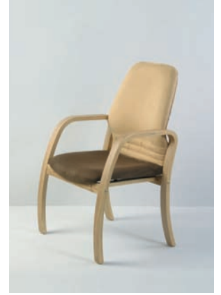
Jaguar laminate visitor 4-legged JW 5180