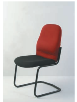
Comet visitor side chair CM 5170