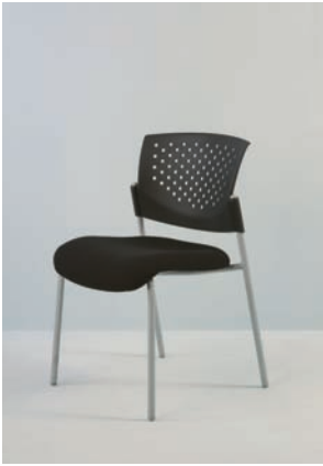
Butterfly chair with upholstered seat BF 2425