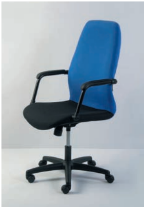
Leopard high-back LP 5190