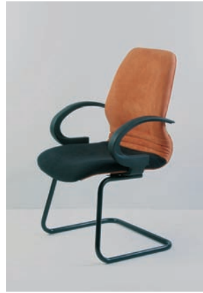
Jaguar visitor JG 5180