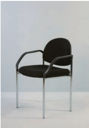
Generic visitor armchair AL 719