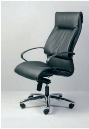
Puma high-back PR 5190