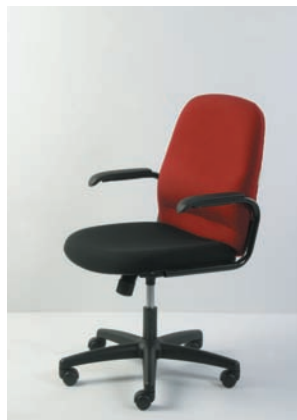
Comet medium-back CM 5150