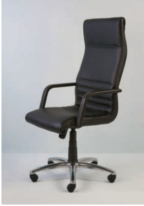
Paq high-back PQ 5190